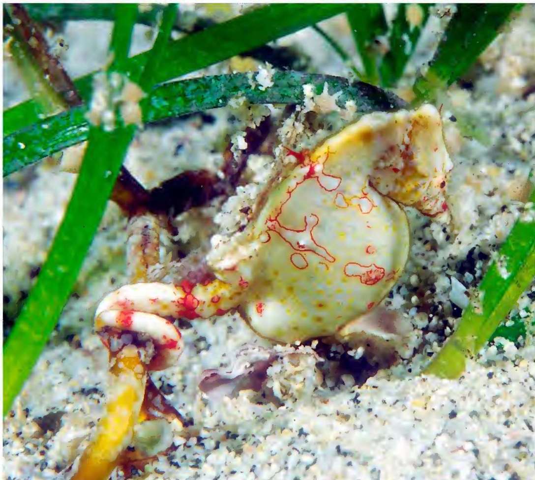
Fig. 4. Hippocampus colemani , this specimen not collected. A probable male as it appears to have a pouch.

Australian Museum in 1973. At the time, a team of 15 collectors, 8 of whom were ichthyologists, collected constantly for one month (Allen et al. , 1976), and did not find this seahorse.